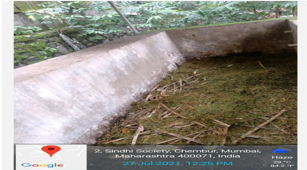
Fig.7.1.3.2. Compost pit installed at VESIT

(Affiliated to University of Mumbai, Approved by AICTE & Recognized by Govt. of Maharashtra)