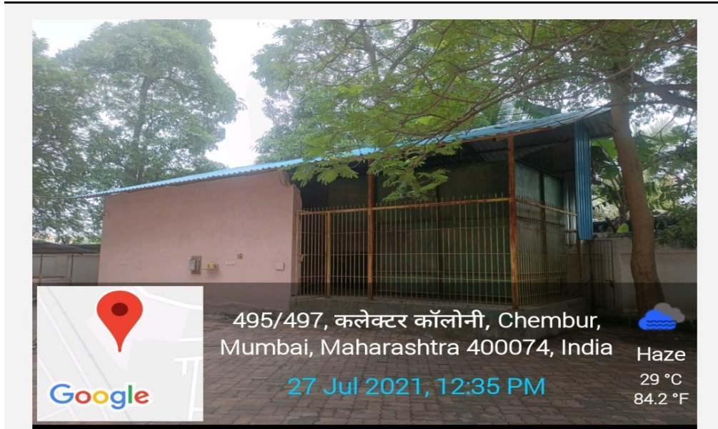
Fig. 7.1.3.4 .Sewage Treatment Plant (Image 1)

(Affiliated to University of Mumbai, Approved by AICTE & Recognized by Govt. of Maharashtra)