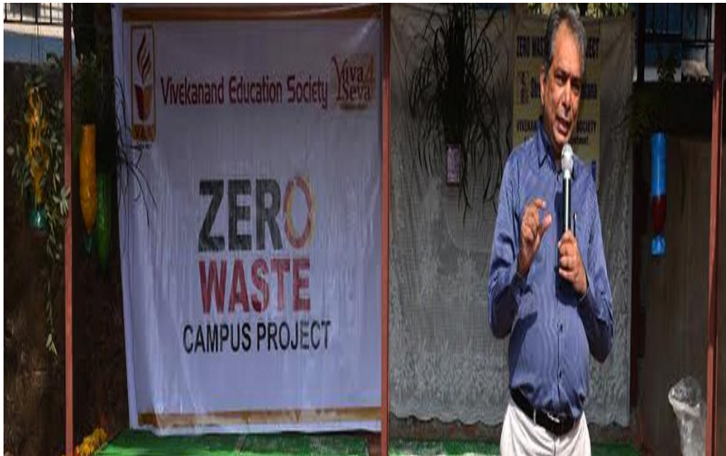
Fig. 7.1.3.1. VES Zero waste campus project ( Link for portal )

(Affiliated to University of Mumbai, Approved by AICTE & Recognized by Govt. of Maharashtra)