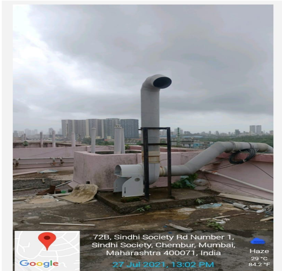
Fig.7.1.3.6. Exhaust of Fume hood installed in VESIT Chemistry Lab

(Affiliated to University of Mumbai, Approved by AICTE & Recognized by Govt. of Maharashtra)