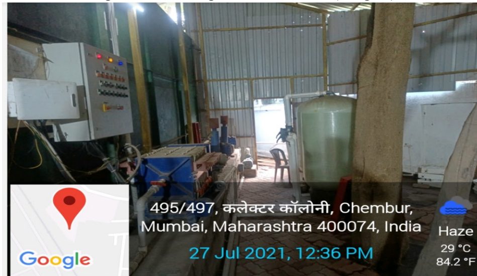
Fig. 7.1.3.5. Sewage Treatment Plant (Image 2)