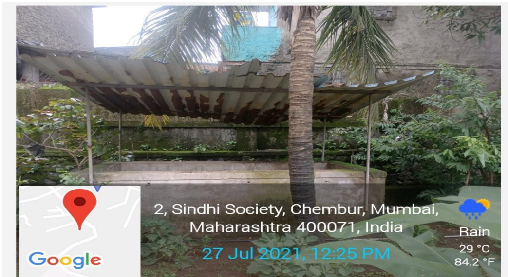
Fig.7.1.3.3. Compost pit (front view)